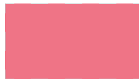
Dokumental® RFA 12/34 fluo pink