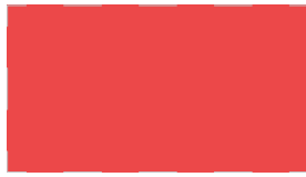
Dokumental® RFA 12/2 red