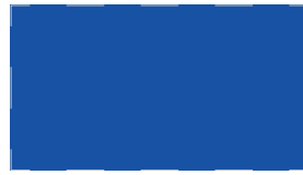
Dokumental® RFA 12/3 light blue