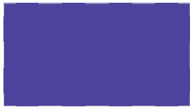
Dokumental® RFA 12/17 violet