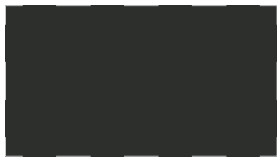
Dokumental® RFA 12/1 black