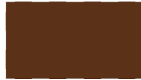
Dokumental® RFA 12/20 brown