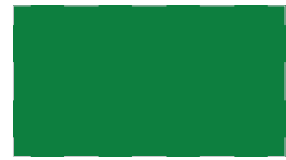
Dokumental® RFA 12/4 green