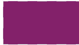
Dokumental® RFA 12/15 magenta