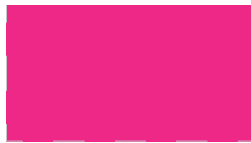
Dokumental® RFA 12/14 pink