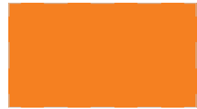
Dokumental® RFA 12/16 orange